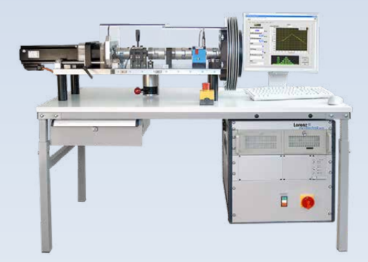
Torque Calibration System for Bottom Bracket Bearings