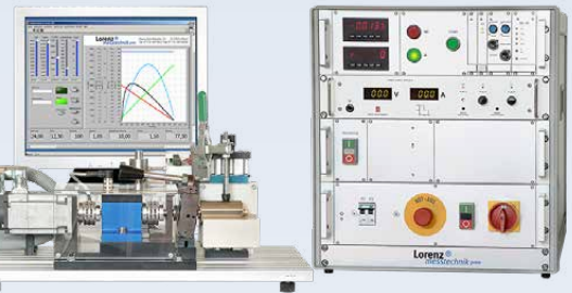
Motor Test Bench